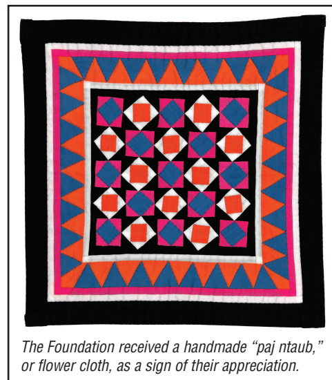
The Foundation received a handmade "paj ntaub," or flower cloth, as a sign of their appreciation.

In Northeast Wisconsin, the Hmong-American Partnership of